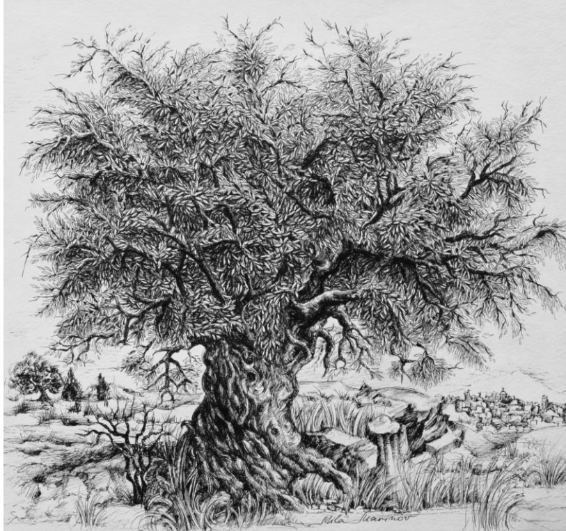
Illustration by Milena Marinov

This theme contains additional spiritual and philosophical perspectives. In the past, many people believed in either predestination or self-determination. Predestination or Fate dictated that the individual had little or no control over the outcome of life which was seen to be divinely premeditated from pitfall to redemption, if so lucky to be one of the few awarded redemption. Self-determination indicates that the individual can willfully lead an idyllic life. Problems arise with the lack of ultimate control. Turning philosophically toward the middle way, modern beliefs tend to accept the inevitable conditions into which we are born which lead to initial societal experiences beyond our control. By linking acceptance of predetermined conditions, contemporary thinking then balances the view by intertwining the individual's response encouraging the individual to rise to the occasion of opportunity and challenge, thereby becoming conditionally self-directed.